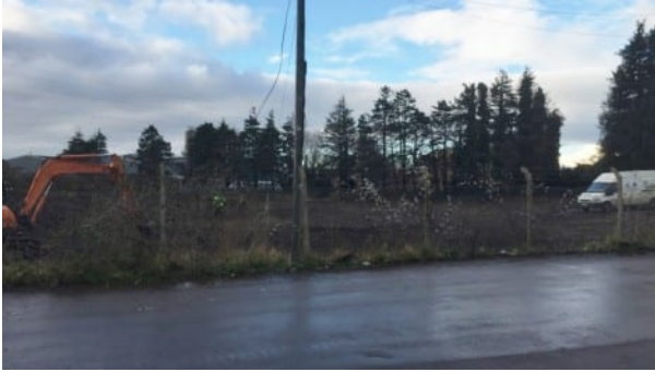
Storage Yard 1.14 acres